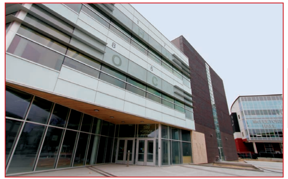
The new Richardson College for the Environment and Science Complex at Portage Avenue at Langside.

Learn more about the Richardson College for the Environment and Science Complex